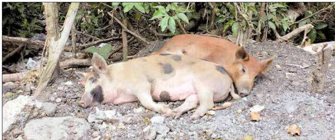
Pig siblings enjoy an afternoon nap near the Adrian dumpster, a location they frequent often.